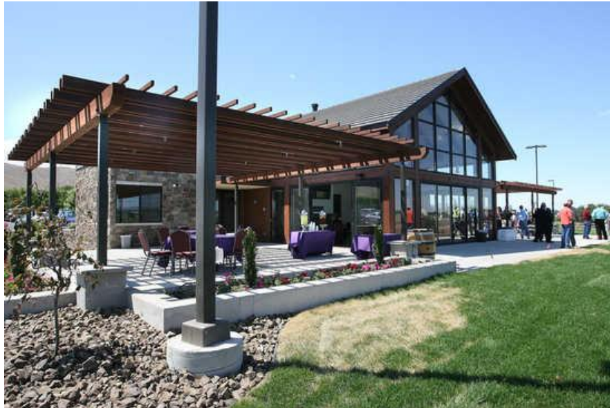
Patrons enjoy a glass of wine at the Clore Center grand opening.

Federal money comes from the U.S. Department of Commerce Economic Development Administration. 152