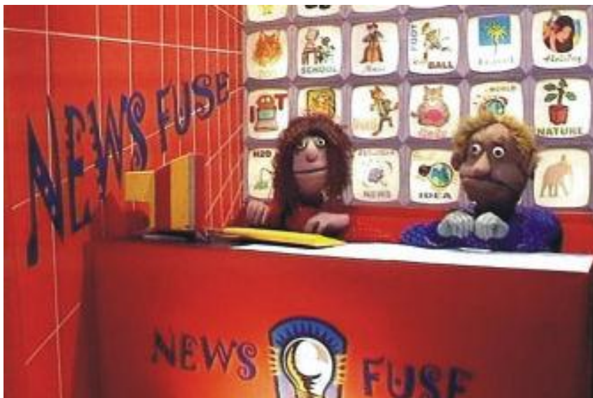
Puppets created by Rafi Peer Theater Workshop

According to news sources, the show will be renamed "SimSim Humara" and set in "a lively village in Pakistan with a roadside tea and snacks stall, known as a dhaba, some fancy houses with overhanging balconies along with simple dwellings, and residents hanging out on their verandas." 75