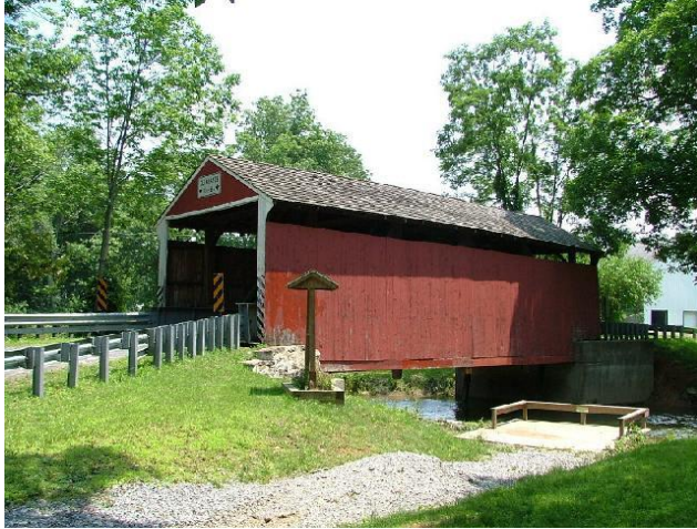
Rock Covered Bridge in Pennsylvania received $1.1 million in federal funds for renovations.

The bridge benefiting the most from the federal preservation funds in 2011 is the Rock Covered Bridge in Pennsylvania, which received $1.1 million in renovations. Rock Covered Bridge